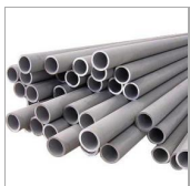
Seamless Stainless Steel Pipe